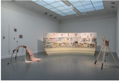
Mercedes Azpilicueta, The Captive: Here's a Heart for Every Fate , 2019. Archives Van Abbemuseum, Eindhoven.

Mercedes Azpilicueta (Buenos Aires, Argentina, 1981, lives and works in Amsterdam)